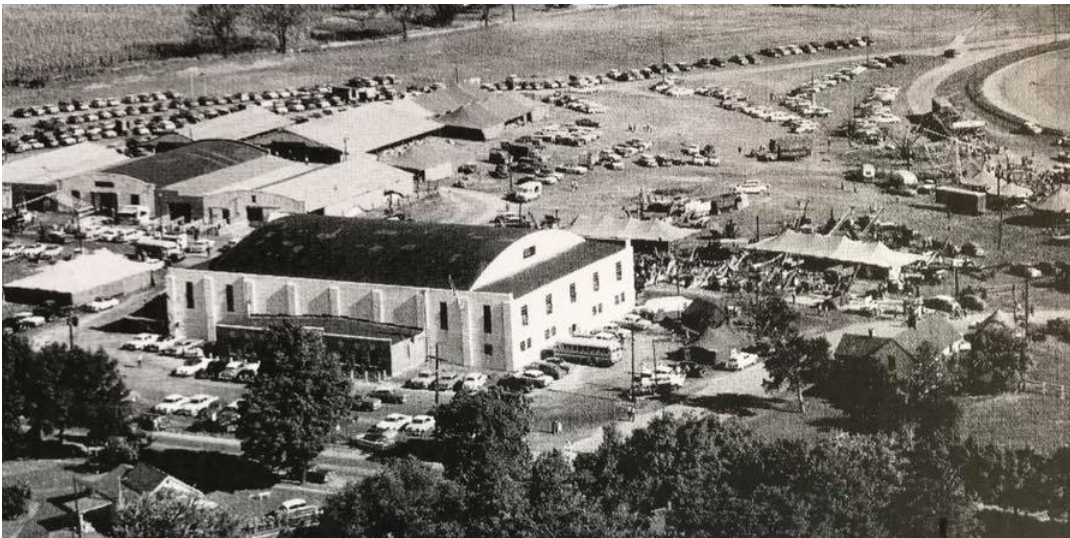
Aerial view of Pickaway County Fairgrounds,