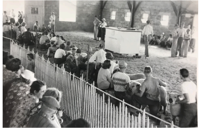
1948 Market Lamb Show

The 1945 Pickaway County Fair featured an amateur horse show, amateur races for junior pony, bicycle and scooter enthusiasts. Exhibits included beef and milk cattle, poultry, sheep, swine, farm produce, farm equipment, needlework, canning, and preserving.